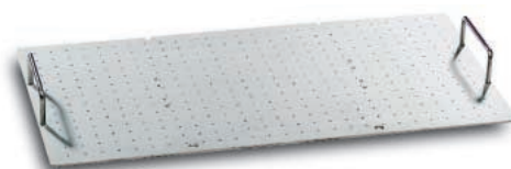
Universal tray type FU