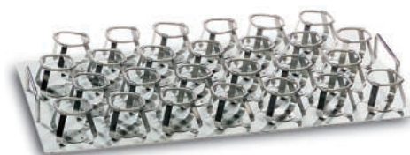
Tray type F