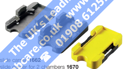
slide carrier 1662 slide carrier for 2 chambers 1670 slide carrier with fastening slider 1470

DJB Labcare - The UK's Leading Centrifuge Specialist info@djblabcare.co.uk www.djblabcare.co.uk 01908 612598