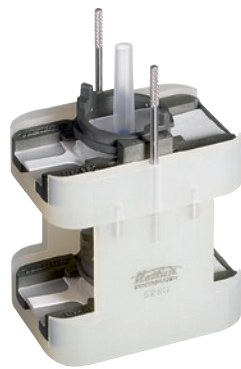
two-tier adapter 5280 illustrated with slide carriers with fastening ring 1662 and cyto chambers 1663