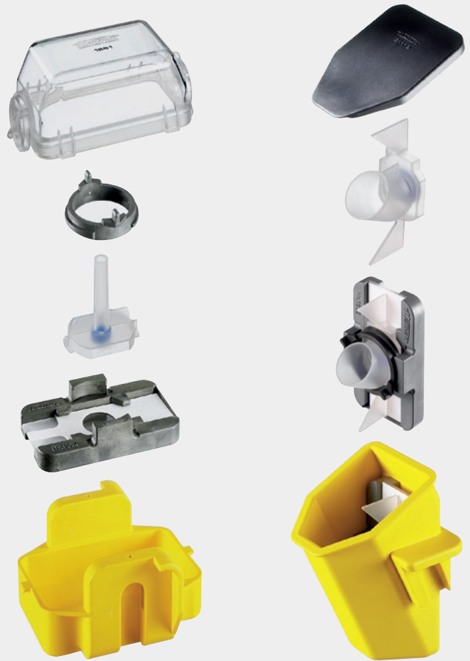
suspension 1660 for cyto chambers