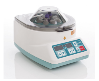
Step 5 — Close the lid and lift to ensure lid is locked. Press the Start Button (The centrifuge is pre-set to correct speed and time).

Step 4 — Place the two blood tube adapters in the empty slots, place your blood tube in one of these adapters and a balance tube in the other (See Picture Left). The blood tubes will protrude from the adapter by approx. 2.5cm.