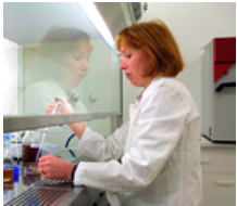
Basic Research / Research Institutes