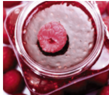
Food / Beverage