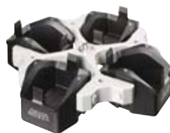
Cat. No. (without carriers) 5699-R