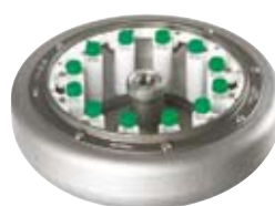
Cat. No. (with carriers) 2362