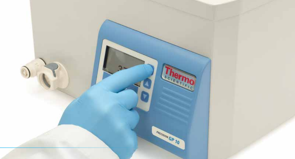
Thermo Scientific Precision Water Baths