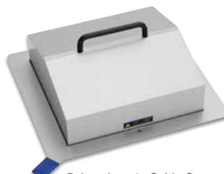
Polycarbonate Gable Cover