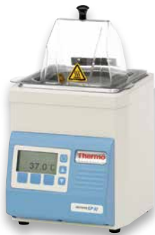
GP 02 Water Bath