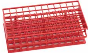
Nalgene Unwire Test Tube Full Rack