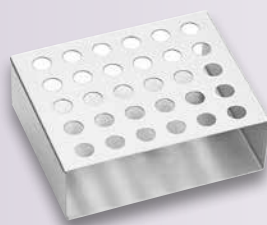
Microfuge Tube Rack