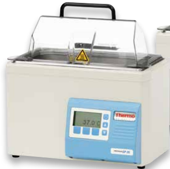
GP 2S Water Bath