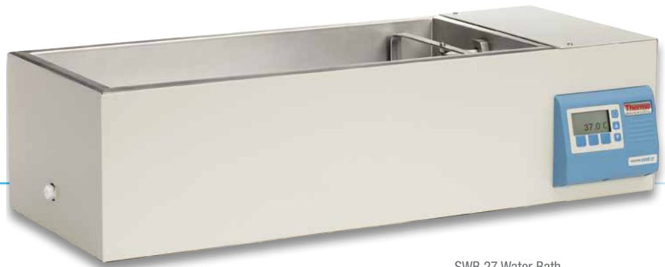
SWB 27 Water Bath