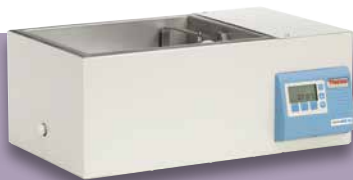
SWB 15S Water Bath