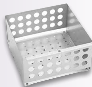
High Wall Tray