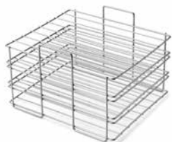
Stainless Steel Petri Dish Rack

All water baths and accessories currently not available in North America.