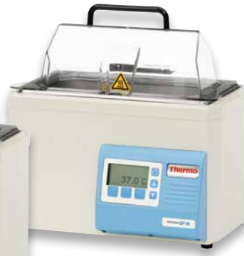
GP 05 Water Bath