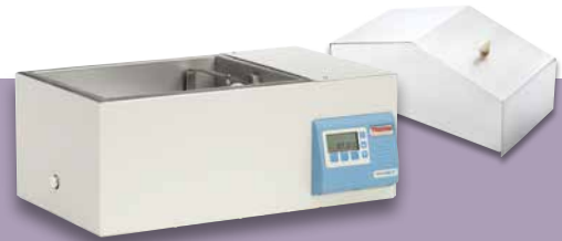
DUB 15 Water Bath