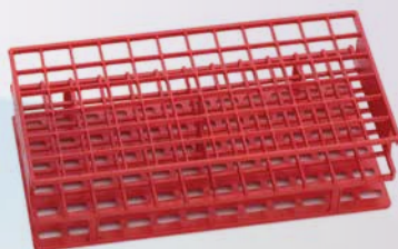
Nalgene Unwire Test Tube Full Rack