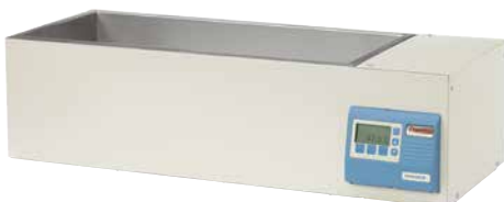
CIR 35 Water Bath