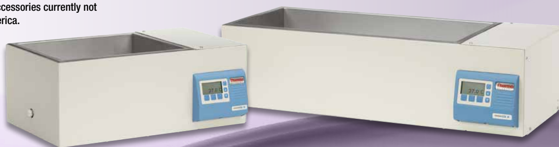
COL 19 Water Bath

†Heater Output at 120V and 240V All water baths and accessories currently not available in North America.