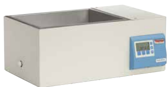
CIR 19 Water Bath