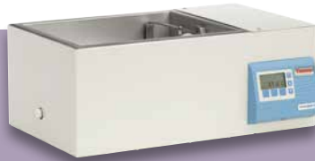
SWB 15 Water Bath