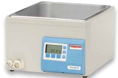
GP 10 Water Bath