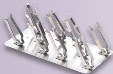
Test Tube Tray