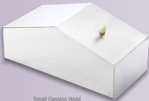
Small Gassing Hood