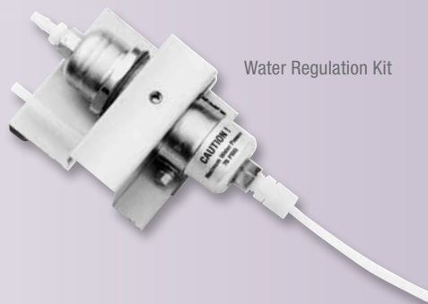
Water Regulation Kit