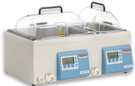
GP 15D Water Bath