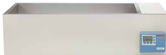
CIR 89 Water Bath