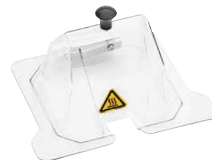
Polycarbonate Gable Cover