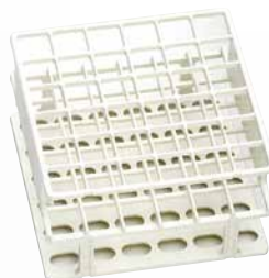
Nalgene Unwire Test Tube Half Rack