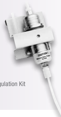
Water Regulation Kit