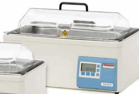
GP 28 Water Bath